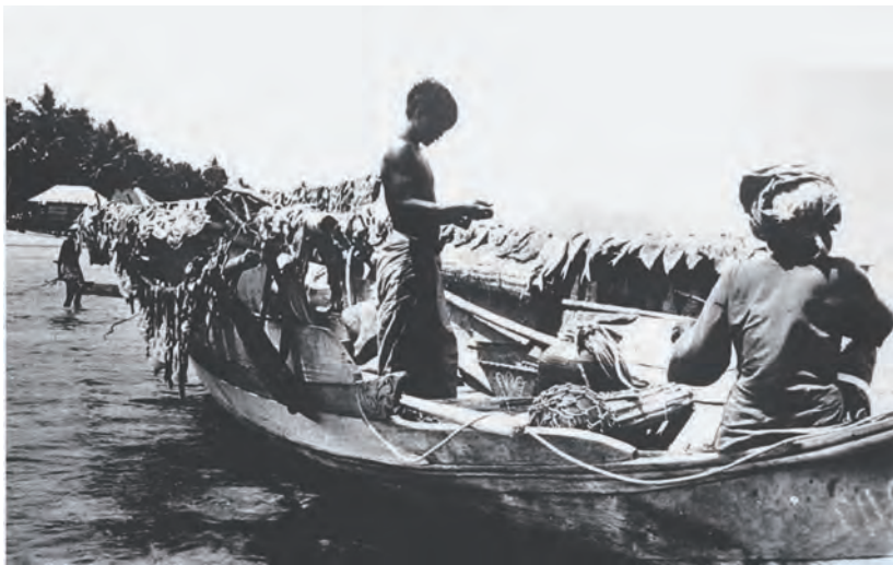
Fig 1: The Samal Bajau Laut, the maritime nomadic fishers of the Sulu Zone, who performed an invaluable role in the economy of the Sulu Zone as gatherers of sea produce.

tion of particular commodities in exchange for other commodities from Europe and China, especially textiles, opium and firearms. However, a factor of particularly striking importance here is how the Chinese table became a critical meeting point of the paradoxical dilemmas and contradictions generated by global market transactions, especially the intense demand for China tea in the farthest extremities of Western Europe. To pay for the tea, tripang or sea cucumber, super-abundant throughout the Zone, began to flow in huge quantities towards South China. 49 Tripang or beche de mer (literally “sea slug”) is a tasteless substance. The dried or pre-soaked body of this edible holothurian, cooked in a rich chicken stock was generally valued for its texture as a food and as an aphrodisiac. This increase in the production of sea cucumber due to new eating habits and styles of Chinese cooking had direct repercussions throughout the Zone, where it highlighted the importance of the labour power of maritime nomadic fishers and slaves in the local regional economy and further altered the balance of power between sedentary coastal trading populations and these maritime nomadic “masters” of the seas.