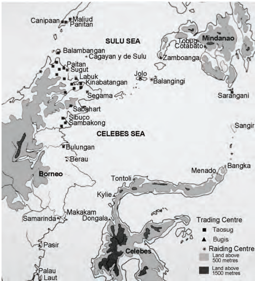
Map 1: Sulu and Celebes Sea

The Sulu Zone constituted a Southeast Asian economic region with a multi-ethnic pre-colonial Malayo-Muslim state, and an ethnically heterogeneous set of societies of diverse political backgrounds and alignments that could be set within a stratified hierarchy of kinship oriented stateless societies', maritime nomadic fishers and forest dwellers. 2 In terms of the international trade economy, the "Sulu Zone" was not an important economic region until the end of the eighteenth century. In part, the paper will attempt to explain how the "Zone" emerged, acquired a shape and became as it was during the period under consideration. It is equally