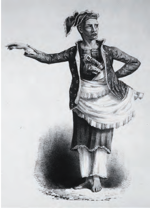
Fig. 2: A "Malay Chief", Taosug datu, of Jolo whose wealth and power was based on the careful regulation of external trade. He is dressed in high fashion – a headcloth of American or Bengal manufacture, a brightly colored Chinese silk jacket, embossed and filigreed with gold thread, satin pants, and several splendid Kris – a reflection of his economic status and social prestige. This beautiful illustration was done in the early 1840s.

For other more ordinary people these worlds were likely to meet in their families and things they made and used in their everyday life. For example, as I witnessed in 1967, a samal laut mother may have made a cradle strap for her new born child from a bolt of unravelled brown cotton cloth and sewed a pattern on it by hand with a new trade needle. The Taoutan , boat cradle, would have been made with Chinese and European materials. Here too, material objects have been fashioned together locally to bear witness to the flow of commodities and information between two or more worlds and across the generations. Acquisitive hardworking people around the Zone transformed aspects of their way of life with