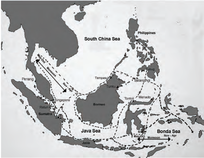
Map 2: Slave Raiding Outside the Philippines in South East Asia

bear silent witness to the advent of sudden affluence in the Zone and deep despair throughout the Philippines. 67