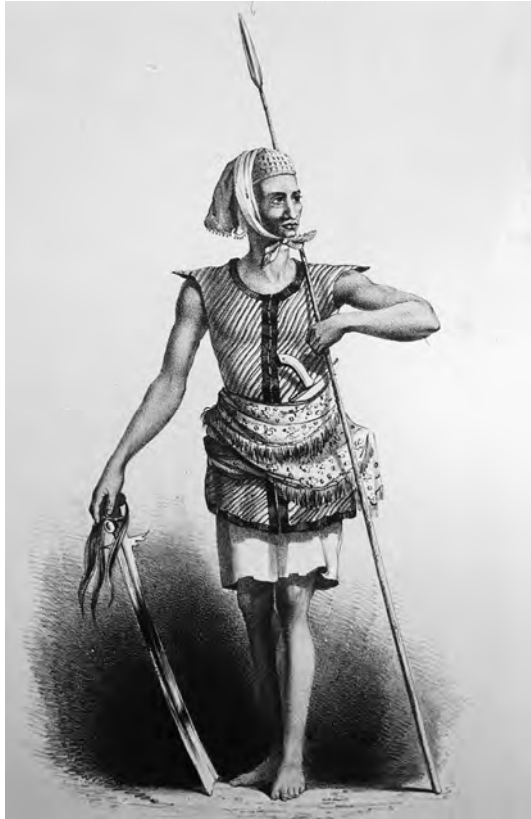
Fig. 3: An “Iranun” sea-warrior attired in the distinctive thick cotton quilted red vest, and armed with a long spear and kampilan, a long heavy “lanoon sword” ornamented with human hair

In pursuit of captives, Iranun and Balangingi terrorized the Philippine archipelago. They preyed on the poorly defended lowland coastal villages and towns of southern Luzon and the Visayan Islands. They even sailed and rowed their warships into Manila Bay, their annual cruises reaching the northern extremity of Luzon and beyond. They earned a reputation as daring, fierce marauders who jeopardized the maritime trade routes of Southeast Asia and dominated the capture and transport of slaves to the Sulu Sultanate. 64 Captive people, from across Southeast Asia in their tens of thousands, seized by these sea raiders were put to