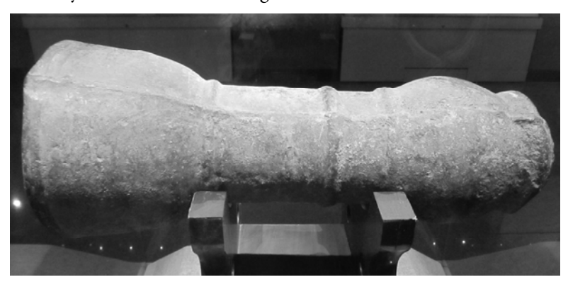
Fig. 2 No. 7 A bronze cannon of the Laizhou guard (1375)<sup>33</sup>

The coastal guards and battalions were equipped with a variety of heavy weapons including bronze cannons and warships. According to Ming shilu , in the first lunar month of 1380 it was regulated that one company should have ten, twenty, thirty and forty soldiers to separately use blunderbusses, swords and shields, bows and arrows, and spears. So, it seems that about ten percent of soldiers used firearms at the time. It is worth mentioning that bronze cannons were equipped provided to the Laizhou guard. Two similar bronze cannons were excavated at Penglai in 1988. The first cannon has a length of 61 centimeter and a weight of 73 kg, and the second one has a length of 63 cm and a weight of 73.5 kg. According to the inscription on the two cannons, both of them were dapaotong 大砲筒 made by the metropolitan Coinage Service (Baoyuan ju 寶源局) in the second lunar month of 1375. The shape of the head of two of the cannon looks like bowls, so they are also called bowl cannon ( wankou pao 碗口 ). One of them is no. 7, and the other is no. 29 of the Laizhou guard, so it is obvious that there must be other many similar cannons with the guard.