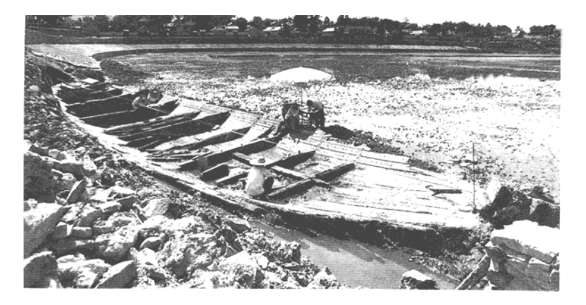
Fig. 3 The Penglai No. 1 Wreck<sup>35</sup>

Two of the ship types employed, surviving as wrecks Penglai No. 1 and Penglai No. 2, are considered to have been official warships built in the south of China in the middle or late Ming Dynasty. Penglai No.1 ship wreck was discovered when Penglai County began to dredge the Xiaohai 小海 (Small Sea) at Penglai Water City in 1984. The remaining part of the ship wreck measures 28.6 m in length, 1.1 m in the narrowest width and 5.6 m in the widest width, and 0.8 m in depth. The remaining part of the Penglai No. 2 ship wreck was discovered in 2005, and it is 21.5 m in length, and about 5.2 m in width. Both of them have a long and slender design with the length-beam ratio approaching to 5:1, and so they perhaps represent the so-called Daoyu 刀 魚 warships used to patrol along the coast.<sup>34</sup>